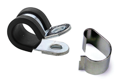
FIGURE 3: SENSOR MOUNTING CLAMP AND CLIP